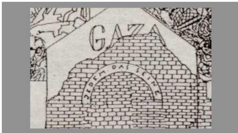
Dagbladet , October 19, 2011