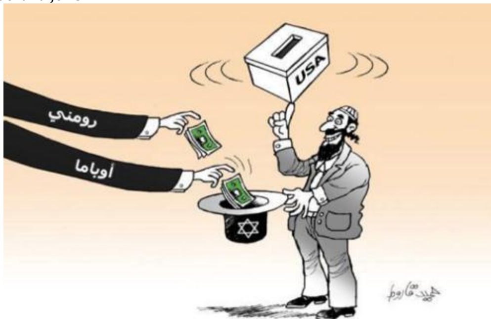
Tishrin, (Syria) August 3, 2012 The arms are those of Obama and Romney.

ADL monitoring has consistently found that US elections are a vehicle for the promotion of anti-Semitic imagery and caricatures. The 2012 campaign was no different, with scores of cartoons depicting President Obama and Governor Romney, and the U.S. electoral system, as controlled by Israel and Jews.