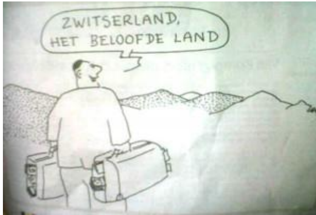
De Morgen, September 8, 2011