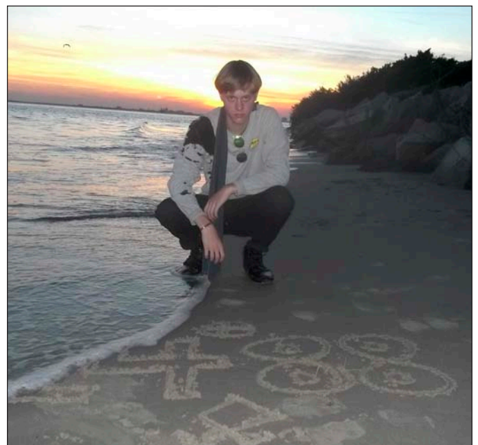
Dylann Roof and "1488" scrawled in the sand