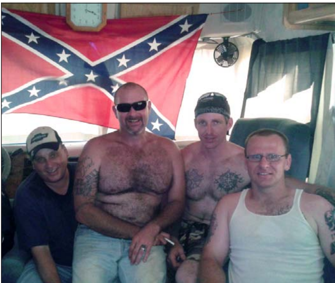
Members of the Alabama-based Southern Brotherhood white supremacist prison gang

The first such gang to emerge was the Aryan Brotherhood, formed in the California state prison system in the 1960s, eventually expanding to the Federal Bureau of Prisons system, too. However, it was the emergence of a variety of similar gangs in other states beginning in the 1980s (often as state prison systems ended earlier practices of segregating prisoners by race) that truly caused a movement to form. By the 1990s, some of these gangs had become active on the streets as well as behind bars.