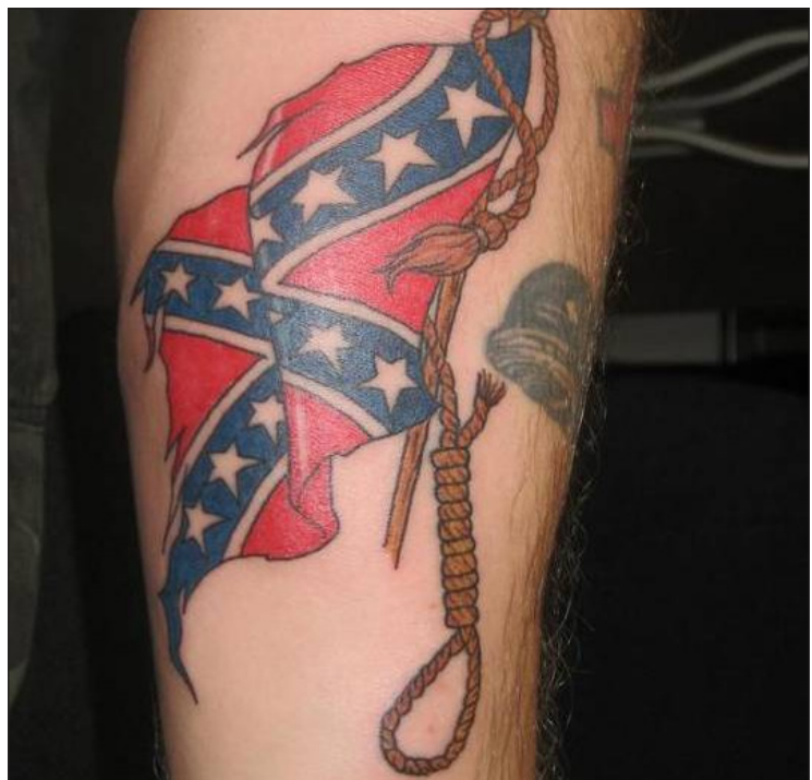
Confederate flag and noose tattoos, common white supremacist symbols

Indeed, one need only look at extremist-related murders to see how large the white supremacist movement looms in the landscape of extremist violence in the United States. The Anti-Defamation League maintains a database of murders and killings that have some sort of extremist