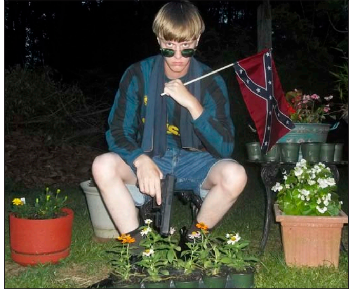
Dylann Storm Roof, suspect in 2015 Charleston shooting spree

As more information about Roof emerged in the following days, including a website and manifesto he apparently created, it became increasingly clear that the church shooting was an act of white supremacist violence. The manifesto described how its author self-radicalized by seeking out white supremacist websites and absorbing their messages.