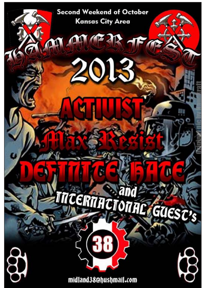
Flier for white power music concert

The movement as a whole is very loosely organized. At the top of the roost are several “hardcore” racist skinhead gangs that admit only members who have “prospected” with them for some time during a probationary period. These groups tend to be connected to violent criminal activity. Two of the most important are the Hammerskins, one of the longest-lived