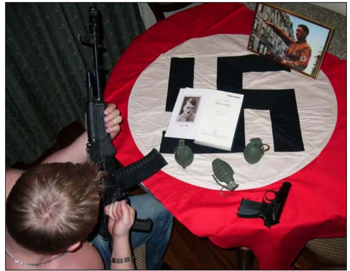
White supremacists often glorify weapons and violence

Preliminarily, ADL data for the past 10 years—from July 2005 through June 2015—indicate at least 279 murders occurred in the United States with some sort of extremist connection. Of these killings, 260 (or 93%) are related to one form or another of right-wing extremism. However, of those right-wing-related murders, 215 (or 83%) are connected to white supremacists (77% of all murders). In other words, the vast majority of extremist-related murders in the United States are committed by people with ties to the white supremacist movement.