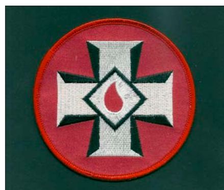
The Blood Drop Cross (aka Mystic Insignia of a Klansman or MIOAK)

In lieu of such rallies, Klan groups have changed their tactics, seeking ways to generate publicity and attention that can be accomplished with a minimum of members. The tactic chosen by two of the larger and more active Klan groups—the Traditionalist American Knights, headquartered in Missouri, and the Loyal White Knights, based in North Carolina—has been spreading Klan fliers in local neighborhoods.