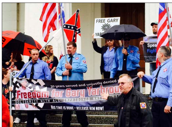
Aryan Nations members at white supremacist demonstration in St. Louis, Missouri, in 2015