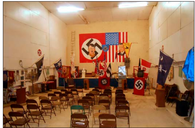
Meeting hall for the modern-day American Nazi Party