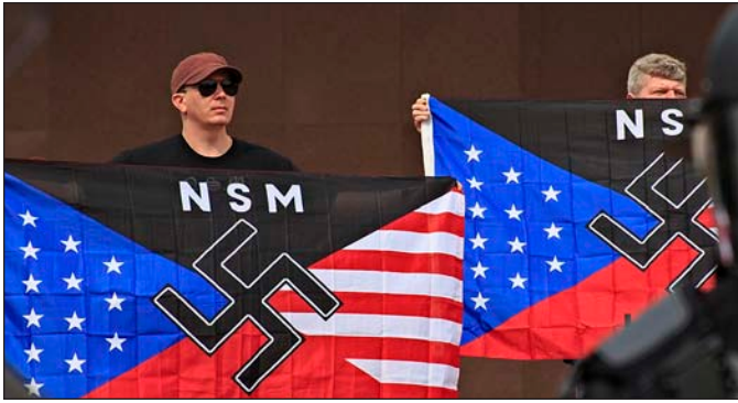
Members of the National Socialist Movement at 2015 rally in Toledo, Ohio