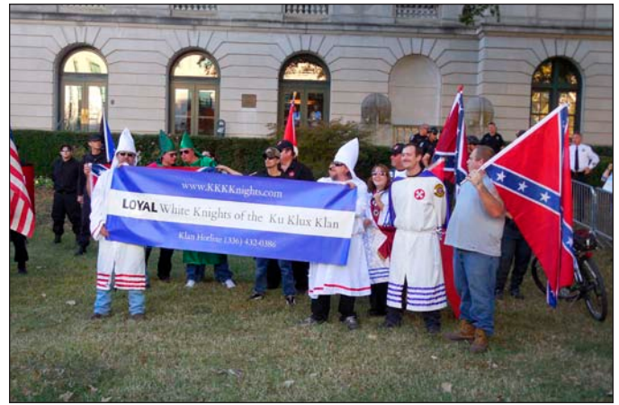
Loyal White Knights of the Ku Klux Klan

For perspective on just how negligible the public Klan presence has become in recent years, consider this: In 1994, Klan groups staged 10 different rallies in the state of Ohio alone. In 2014, 20 years later, there were only around 10 confirmed Klan rallies across the United States (Klan groups have claimed a few additional events, but no confirmation can be found that they actually took place).