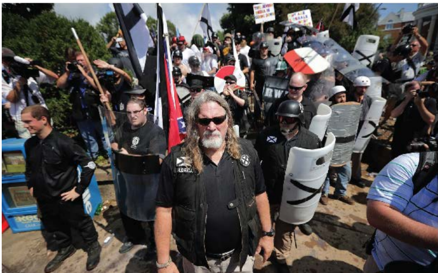
CHARLOTTESVILLE, VA - AUGUST 12: White nationalists, neo-Nazis and members of the "alt-right" exchange insults with counter-protesters as they attempt to guard the entrance to Emancipation Park during the "Unite the Right" rally August 12, 2017 in Charlottesville, Virginia. After clashes with anti-fascist protesters and police the rally was declared an unlawful gathering and people were forced out of Emancipation Park, where a statue of Confederate General Robert E. Lee is slated to be removed.

To learn more about how ancient antisemitic tropes manifest today, visit ADL's "Antisemitism Uncovered: A Guide to Old Myths in a New Era."