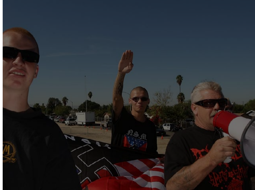
A member of the white supremacist group, the National Socialist Movement, holds a swastika flag and salutes at the NSM's anti-illegal immigration rally near a Home Depot store in Riverside, California.