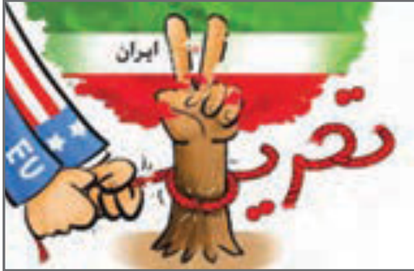
Graphic from a current Iranian state textbook, Grade 10, Defense Preparation, p. 120. The text in red translates to “Sanctions”. The text in black says “Iran”.

The textbooks also teach that America is and has been committed to regime change in Iran since 1979, as part of an American-led “satanic plan” to subjugate true Islam. 7 As such, these books also teach that economic sanctions by America and by European countries are part of this scheme that poses an existential threat to Iran, its people, and its state, rather than as a penalty for any specific Iranian conduct.