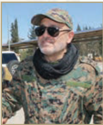
شهيد مصطفى بدرالدين از حزب الله لبنان

“The Martyr Mustafa Badreddine, From Hezbollah of Lebanon”