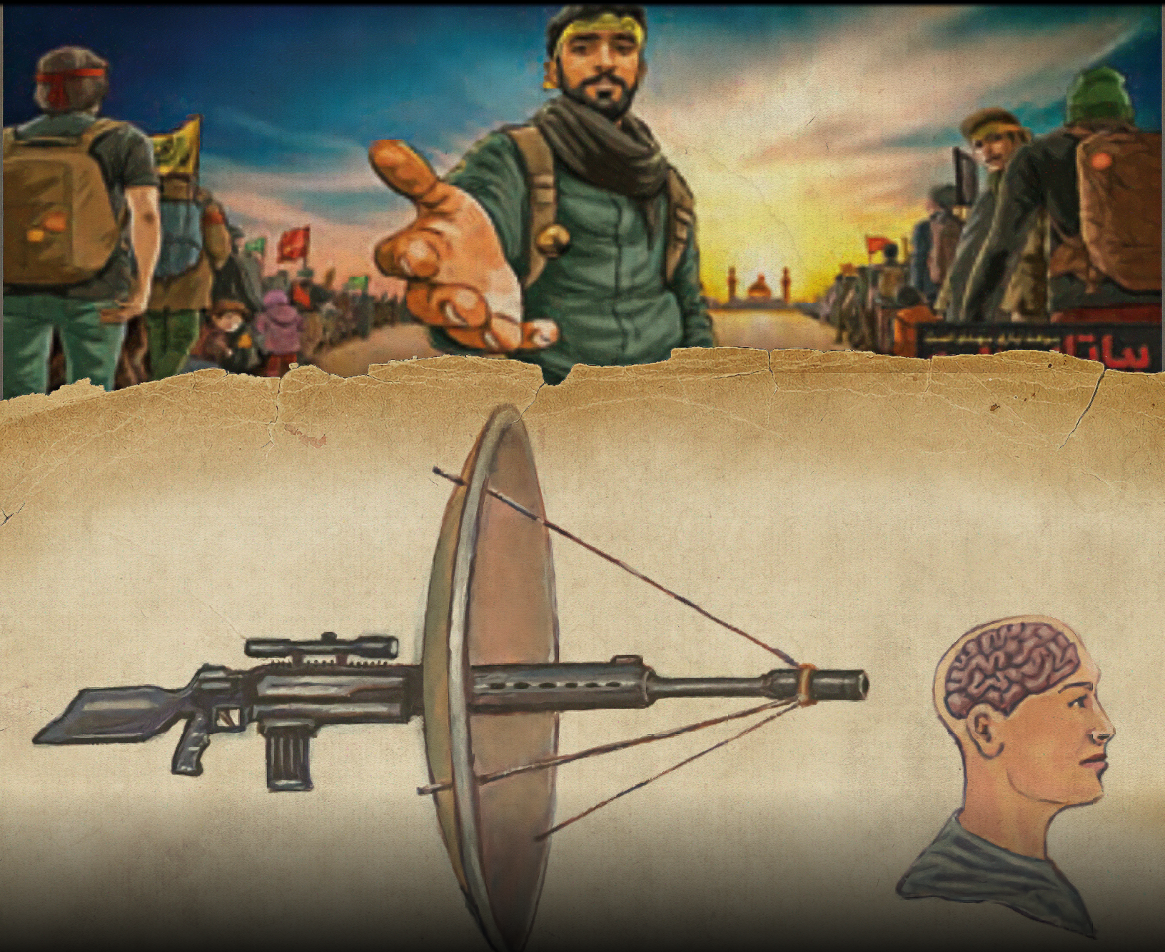
(top) Image titled "Let's Go" from a current Iranian state textbook depicting an IRGC officer killed in Syria named Mohsen Hojaji. Grade 10, Defense Preparation, page 123