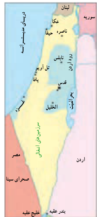
Israel's territory within the Green Line is labeled here in green as "The Occupied Territories"

Grade 11, History of Contemporary Iran, p. 252