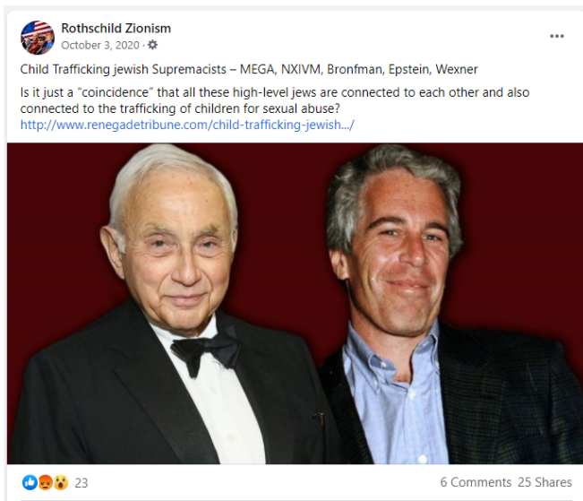
Exhibit 4: Post alleging network of Jewish pedophilia on October 3, 2020 (Reference ID: FB-9M9ALFTU)

This post appears in the public community page “Rothschild Zionism,” which has 21k members and has existed since August 10, 2012. It describes itself as “About the dynastic Rothschild Bankster-Gangster Crime Family - Public Enemy Number One threat to world peace, liberty, and