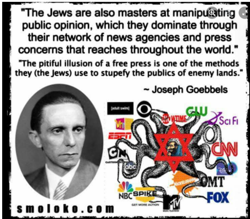
Exhibit 1: Post quoting Joseph Goebbels with Jewish domination tropes on May 20, 2021 (Reference ID: FB-4G1HJ8B1)

In May 2021, we requested Facebook take down the following seven examples of antisemitic content. Facebook rejected these requests both on the first and second levels of review. We request that the Oversight Board overturn this decision and send a clear message that antisemitism has no place on Facebook.