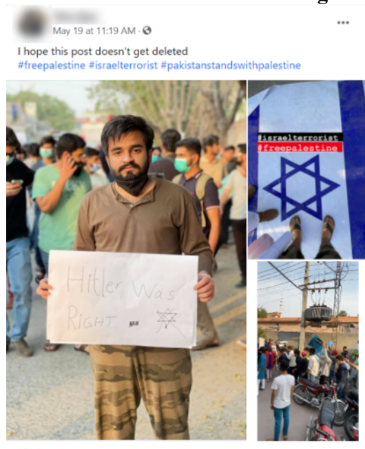
Exhibit 2: Post of “Hitler Was Right” on May 19, 2021 (Reference ID: FB-R2T4X780)

Violence between Israel and Palestinians escalated significantly in May 2021. People have diverse perspectives on this violence and the issue generally. Criticism of Israel and its policies and actions regarding the Israel-Palestinian conflict is not inherently antisemitic, and society should debate and discuss these issues like any others. However, such criticism must not fall into antisemitic tropes or hatred of Jews. This post, like many others during this period, clearly crosses that line. The post features a person holding a sign saying “Hitler Was Right” alongside a crossed out Jewish Star of David. Praising Adolf Hitler, the murderer of six million Jews, is not political debate but is clearly “a direct attack on people based on... religious affiliation” and glorification of violence.