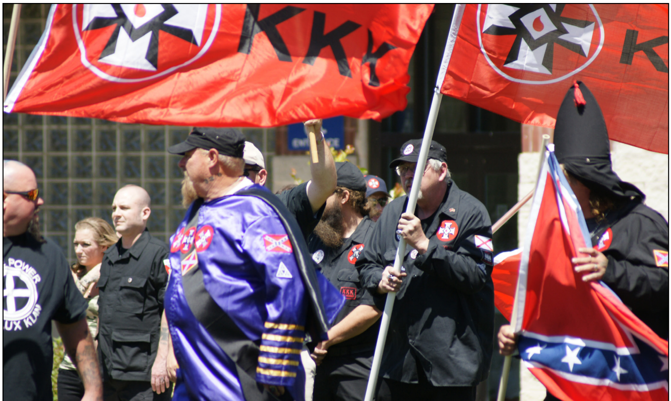
Klan members stand in front of the Law Enforcement Center in Rome, Georgia, April 2016

Members, associates, and supporters of the Klan are focused on their perceived threats to the white race, including the Black Lives Matter movement, Islam and the building of mosques, the LGBT community (particularly transgender restrooms), “black on white crime,” immigration (particularly Mexican), and the threatened removal of Confederate symbols from public spaces such as government buildings, parks, and schools.