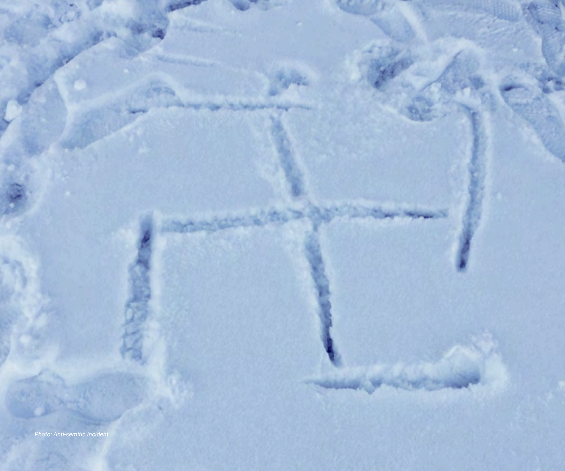
Photo: Anti-semitic Incident