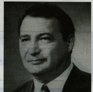
Abraham H. Foxman