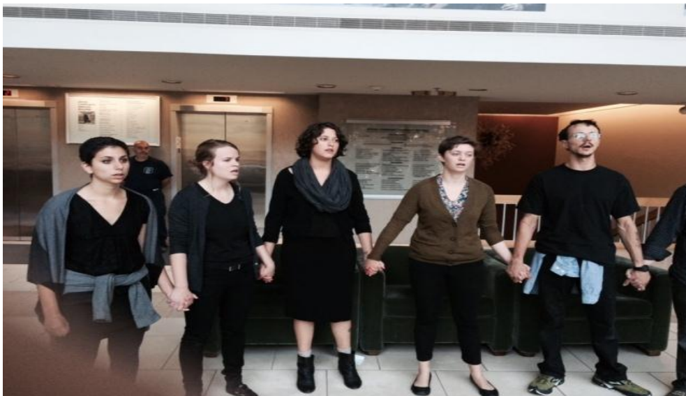
JVP members protesting at the Philadelphia Jewish Federation building

A month earlier, activists from JVP and another local anti-Israel Jewish group took over the offices of FIDF in New York City. At the FIDF offices, the demonstrators began to protest and conducted a “die-in” inside of the office building. A group of nine protesters refused to leave, which led to their arrest.