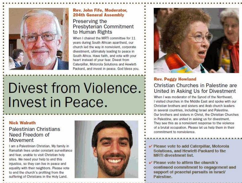
A JVP flier circulated at the Presbyterian Church General Assembly in 2012

newspaper that urged Berkeley’s Senate President to not veto the resolution. The ad compared Israeli policy to Jim Crow laws in the South in the late 19th and first half of the 20th centuries.