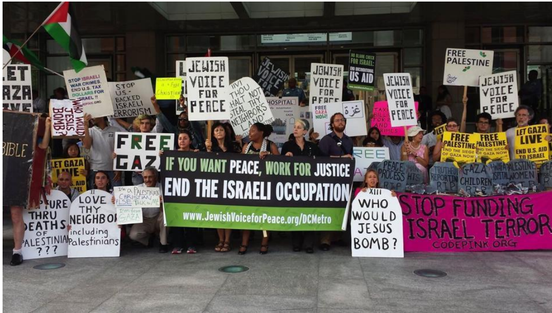
A JVP-sponsored anti-Israel rally

In August 2014, JVP members interrupted speeches being delivered at two different pro-Israel gatherings, which took place in Chicago, Illinois and Durham, North Carolina. One of those events, held at the Chicago Hilton Hotel, featured several interruptions of the keynote speech delivered by Former Israeli Ambassador to the U.S., Michael Oren. Those who interrupted Oren screamed, “Stop killing, shame on you” repeatedly until they were removed from the venue.