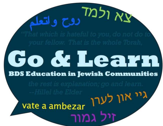
A flier from a JVP-sponsored teach-in at University of Michigan

JVP has also co-sponsored the "Summer BDS Institute" with the American Friends Service Committee (AFSC) for at least the past two years. The program, which has been promoted as "fun in a summer camp-