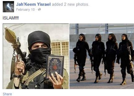
One of Alton Nolan’s Facebook posts