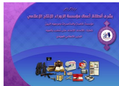
Poster announcing the creation of Al Zora, an ISIS organization for women

Below are profiles of the American women linked to terrorism in 2014: