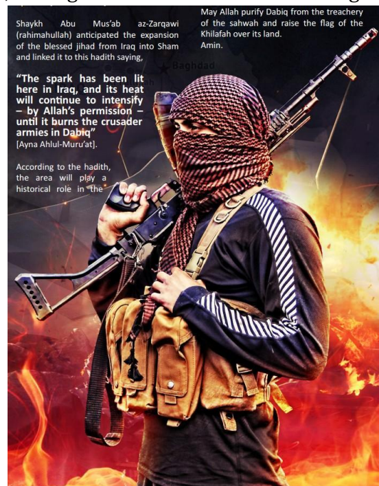
Image from ISIS' online magazine, Dabiq

Perhaps the biggest threat to domestic security is the potential for some of these individuals to return to the U.S. with new training and experience, as well as reinforced hopes for carrying out attacks in the communities they came from.