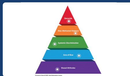
The Pyramid of Hate

“The section that went into depth about the different ways antisemitism can manifest was very informative and something I hadn’t seen summarized in one place before.”