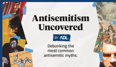
Antisemitism Myths and Tropes