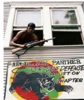
NBPP member in Houston

In advance of the 2011 "National & International Day of Action & Unity," the NBPP released promotional materials highlighting "Zionism" as one of the "pressing issues" the event aimed to address, listing Jews and Jewish institutions among its stated targets. The materials cited what it views as Jewish economic exploitation of Blacks, in particular, as a driving force behind the action. "It's good to expose the manipulation... the abuses of the Zionists and the Jews on how they have manipulated our community and [sic] sucking our resources," then National Chairman Malik Zulu Shabazz stated the month before the event. He continued, "What you gonna do about it? They still have their hands in our economy. They still are making money off of us. What ever happened to the spirit of 'shut 'em down'? Why don't we shut some people down? Some tennis shoe companies down, shut some diamond stores down, why don't we start to impact the economy of our oppressor?"