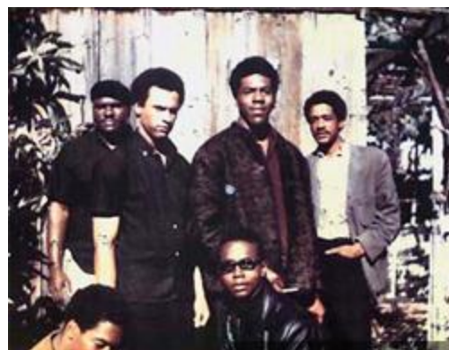
Original Black Panthers

The New Black Panther Party for Self Defense (NBPP) takes its name from the original Black Panther Party, formed by Huey Newton and Bobby Seale in Oakland, California, in 1966. The original Panthers combined militant Black Nationalism with Marxism and advocated Black empowerment and self-defense, often through confrontation. By 1969, the group had an estimated 5,000 members spread throughout 20 chapters around the country. In the early 1970s, however, the group lost momentum and most of its support due to internal disputes, violent clashes with police, and infiltration by law enforcement agencies. Despite the collapse, the group's mystique continued to influence radicals, and by the early 1990s a new generation of militant activists began to model themselves after the original Panthers.